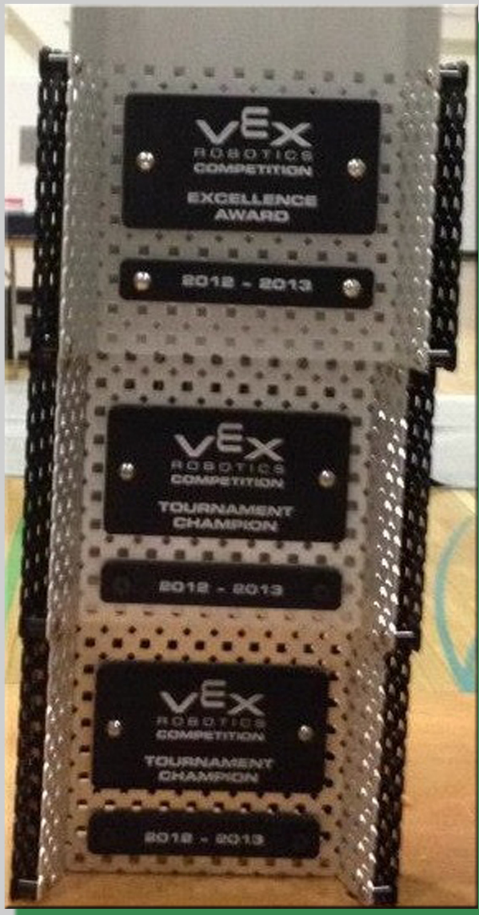
The three awards that the team received at CSUN

-fied for the world championships. Additionally, 599D won the Excellence Award for the competition, giving the sub-team a triple qualification for VEX World. 599A is also doubled qualified, the reward for all of their dedication and ingenuity for their robots.