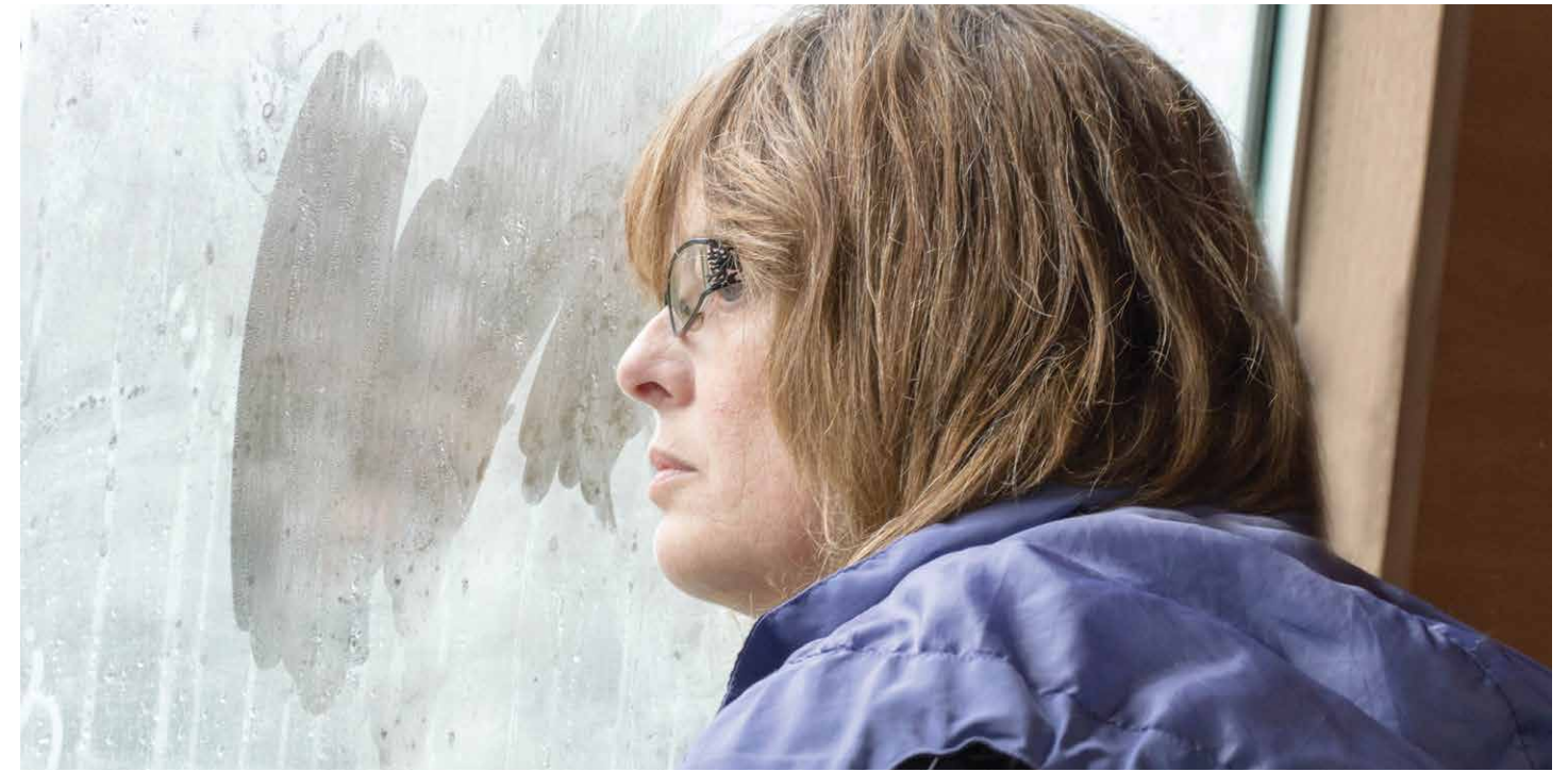
Visual exposure to nature can effectively reduce stress, particularly if initial stress levels are high.

for goods and services in central business districts that have high-quality tree canopy.