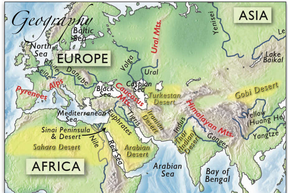
Some World Deserts

We'll join in the everlasting song, and crown Him Lord of all!