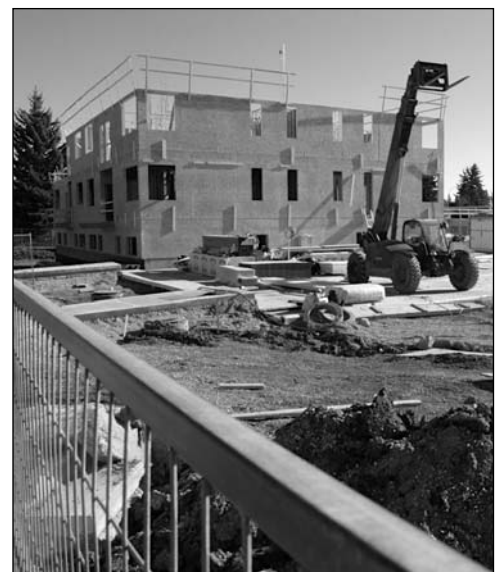
A view of the Westcorp site.

For more information on these and other events at the Whitemud Crossing branch go to www.epl.ca . The branch is located at 4211 - 106 Street.