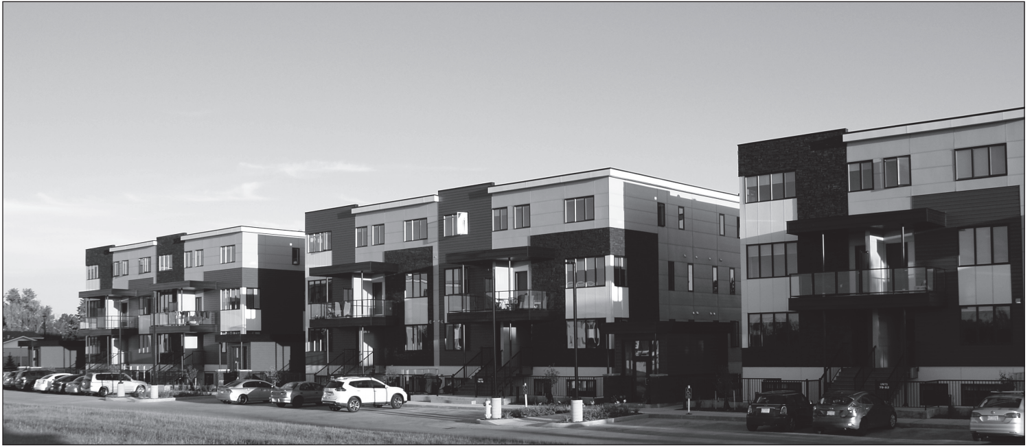
A view of the recently-completed Edgeway apartment complex in Malmo.