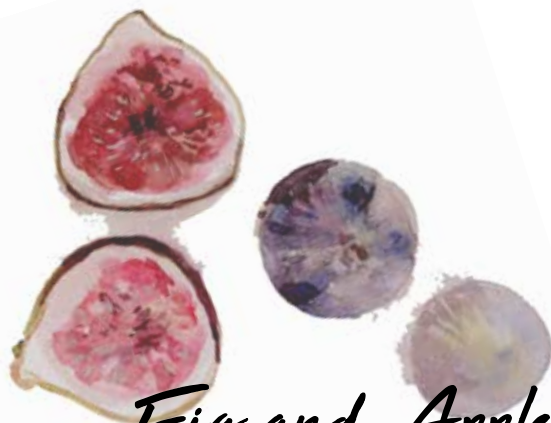
Fig and Apple

Campari & vermouth syrup, Fever Tree Tonic Water