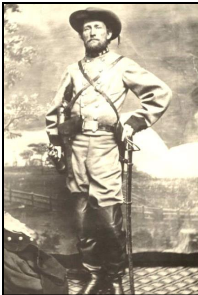
Colonel John Singleton Mosby Commander, Mosby's Rangers 1833-1916