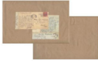
Example of portfolio case: front and back image of a large envelope.