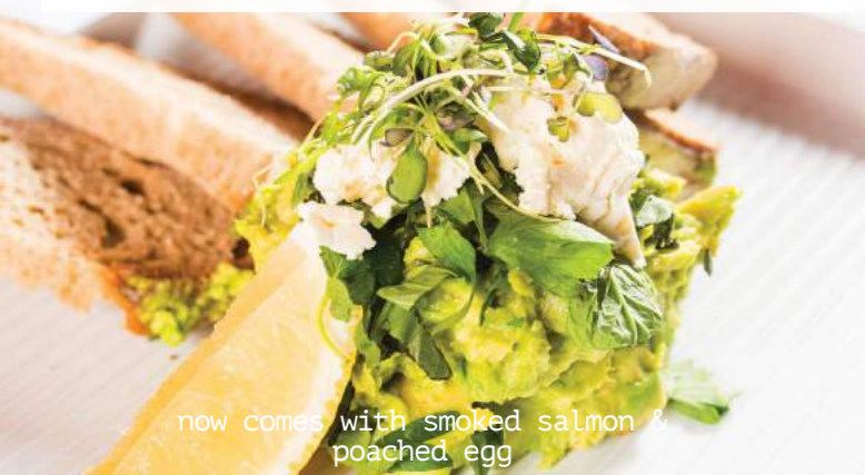
now comes with smoked salmon & poached egg

Crushed Avocado * 20 avocado, lemon, feta cheese, mixed herbs, smoked salmon, poached egg, chia seed, avocado oil served on rye