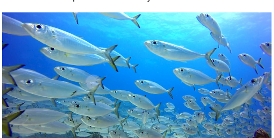
Window on the Undersea World

Steve De Neef | Canada | 5 min Program 9 | Canada Program | Saturday 7:00PM With extraordinary evesight and the fastest strike in the animal Local fisherman in the small village of Punta Allen. Mexico. have created a unique sustainable lobster-fishing co-op. The development of special methods and self-regulation ensure they never over-harvest. Such solidarity benefits the community and makes generosity possible when unpredictable fresh-water intrusion affects parts of the fishery. -ST