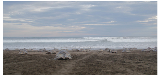
Why Just One?

kingdom, the mantis shrimp is one heavy hitter. It is not just their killer punch that is impressive, Mantis shrimp have an