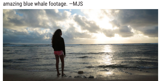
My Haggan Dream 2017 SHORT AWARD