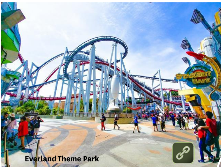
Everland Theme Park

Exciting theme parks and water parks. Zoo, etc. They will give you new perspective on Korea.