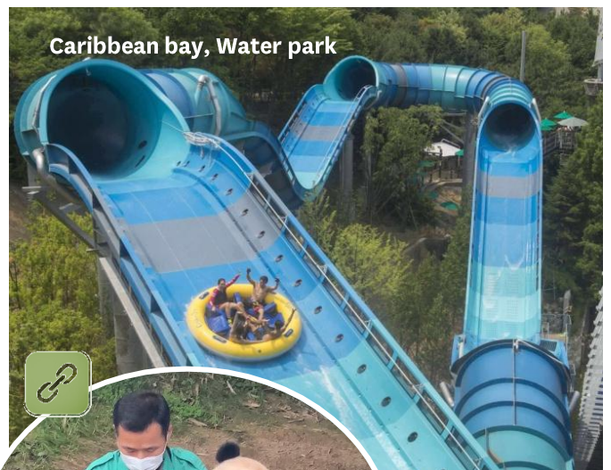
Caribbean bay, Water park