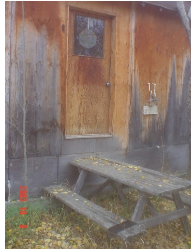
... picnic stairs