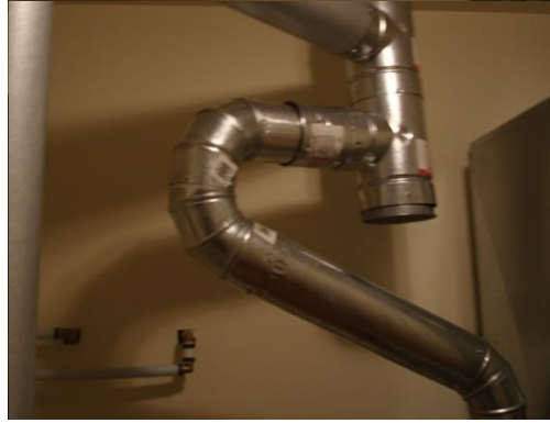
... creative ducting