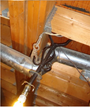
... an innovative ceiling light