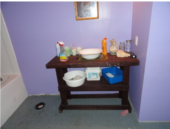
... move in before plumbing completed