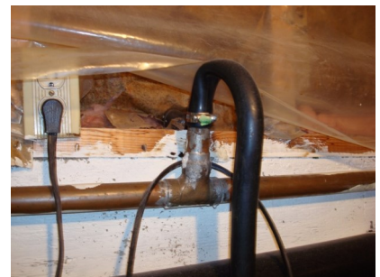
... unsafe water and eclectic