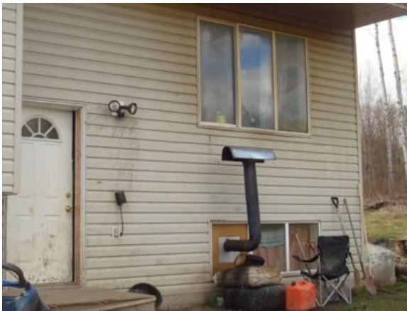
... woodstove vent under window