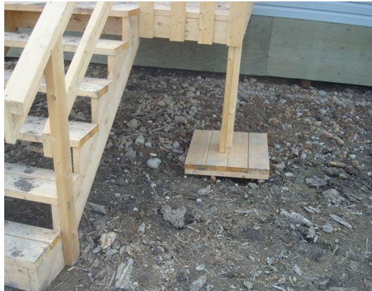
... interior lumber for exterior stairs/deck