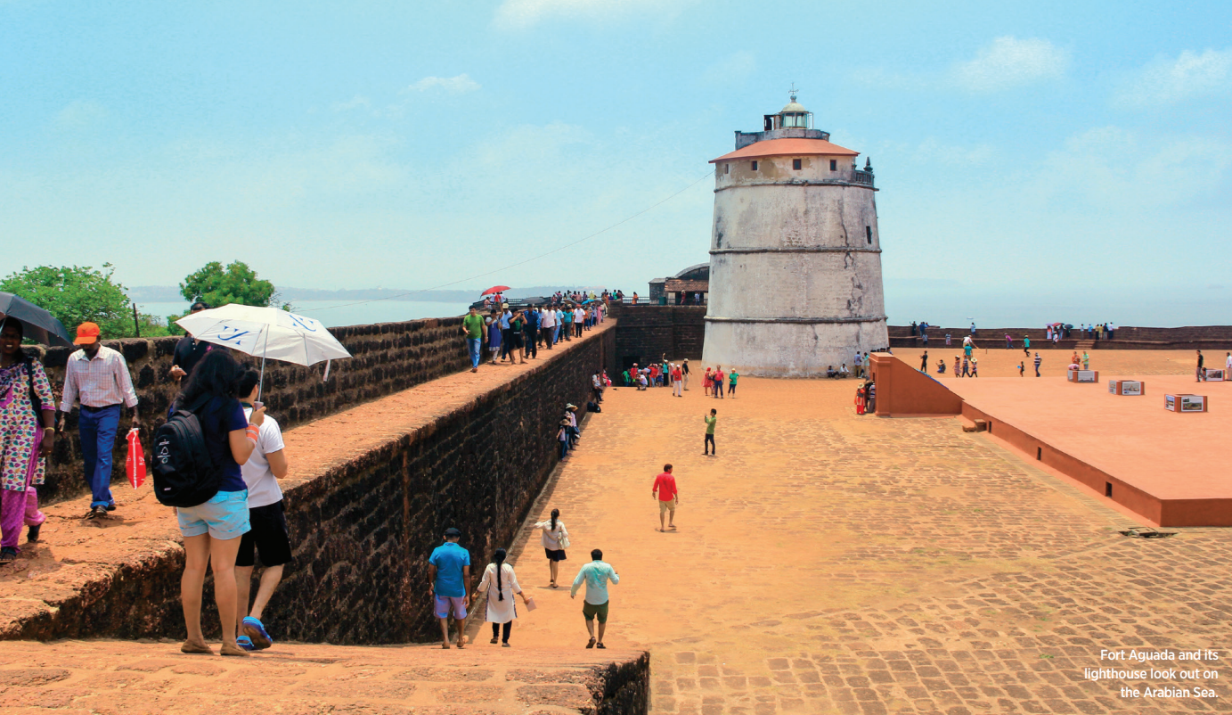
Fort Aguada and its lighthouse look out on the Arabian Sea.