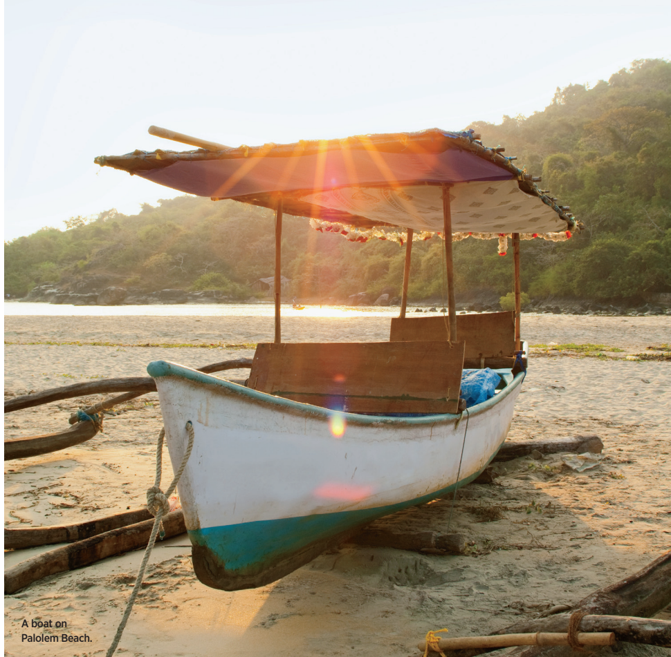
A boat on Palolem Beach.