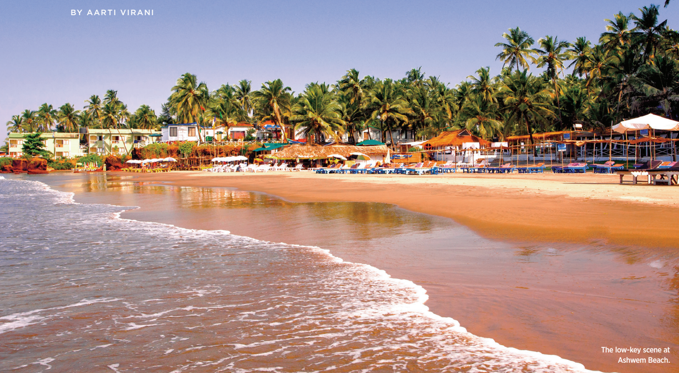
The low-key scene at Ashwem Beach.

Goa is India's smallest state (slightly larger than Rhode Island), on the rugged western Konkan Coast along the Arabian Sea. Yet it draws six million tourists to its palm-fringed shores each year.