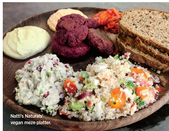
Natti's Naturals' vegan meze platter.

Ourem Palace, Canacona; 011-91-860-500-7600; parinamayogastudio.com ; classes, from $6 a person), an open-air studio that welcomes drop-ins. To pick up the pace, you can choose from a menu of adrenaline-pumping fun at Vaayu Ocean Adventures (Ashwem Beach Rd., opposite Holy Cross Chapel, Ashwem Beach, Mandrem; 011-91-985-005-0403; vaayuoceanadventures.in ; rates for excursions vary), a water-sports outfit that offers wakeboarding, surfing and other guided activities. To refuel, take a 30-minute drive to Natti's Naturals (Anjuna Rd., Mazal Waddo, Anjuna; 011-91-703-824-6918; lunch for two, $15), the brainchild of an Austrian-Punjabi naturopath, whose eclectic menu features a gluten-free orange and ginger cake; the more indulgent offerings here are served with mounds of toasted pão , or yeasty Portuguese rolls. Finally, don't miss an Ayurvedic cooking class, steered by millennia-old traditions that regard food as healing medicine, at