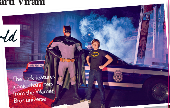
The park features iconic characters from the Warner Bros universe

Looney Tunes lovers shouldn't miss a day at this splashy indoor amusement park, the latest addition to the Emirates' already extensive entertainment menu. Visitors are welcomed by a golden Bugs Bunny statue before they venture into one of the six themed areas, or "lands," ranging from Gotham City to Cartoon Junction, complete with a Tweety Bird-themed carousel ride and an interactive laser pointer adventure. The billion-dollar playground is situated on Yas Island, a paradise whose other attractions include the world's first Ferrari-branded theme park and a water-filled wonderland.