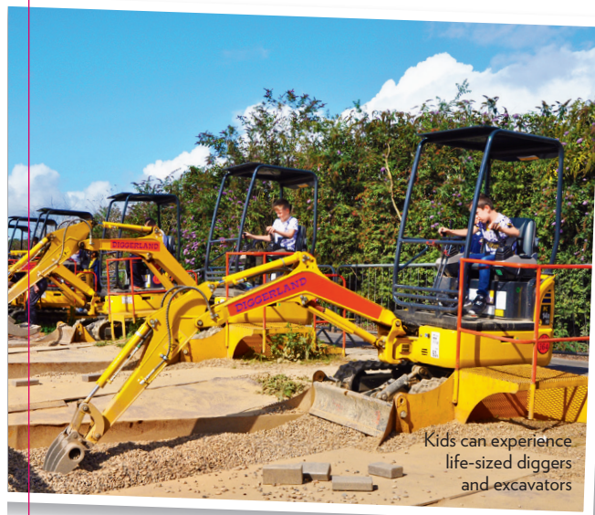
Kids can experience life-sized diggers and excavators