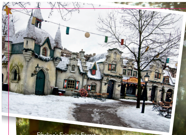
Efteling's Fairytale Forest is inspired by the stories of the Brothers Grimm.