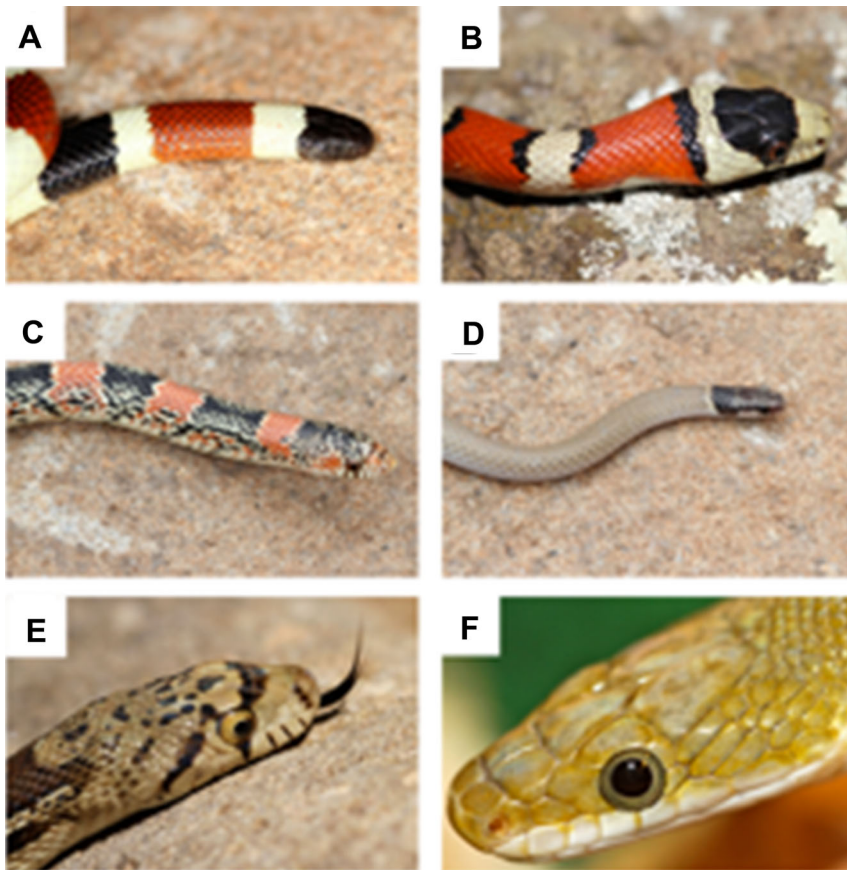
Fig. 1. Representative taxa sampled for pigment analysis. (A) Arizona coral snake, Micruroides euryxanthus . (B) Arizona mountain kingsnake, Lampropeltis pyromelana . (C) Long-nosed snake, Rhinochelius lecontei . (D) Yaqui black-headed snake, Tantilla yaqui . (E) Gopher snake, Pituophis catenifer . (F) Green rat snake, Senticolis triaspis .

Reptiles and amphibians (including snakes) produce colors by selectively reflecting or absorbing certain wavelengths of light with specialized cells called chromatophores (reviewed in Cooper and Greenberg 1992; Olsson et al. 2013). There are three principle kinds of chromatophores: erythrophores, iridophores, and melanophores. Erythrophores (sometimes