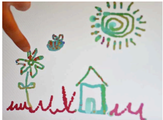
Figure 2. Playing the sound effects embedded in a scene.

You can sing a melody while you draw a shape and then play it back in a different way by touching the notes in a new order. In this way you can transform the melody into a new one.