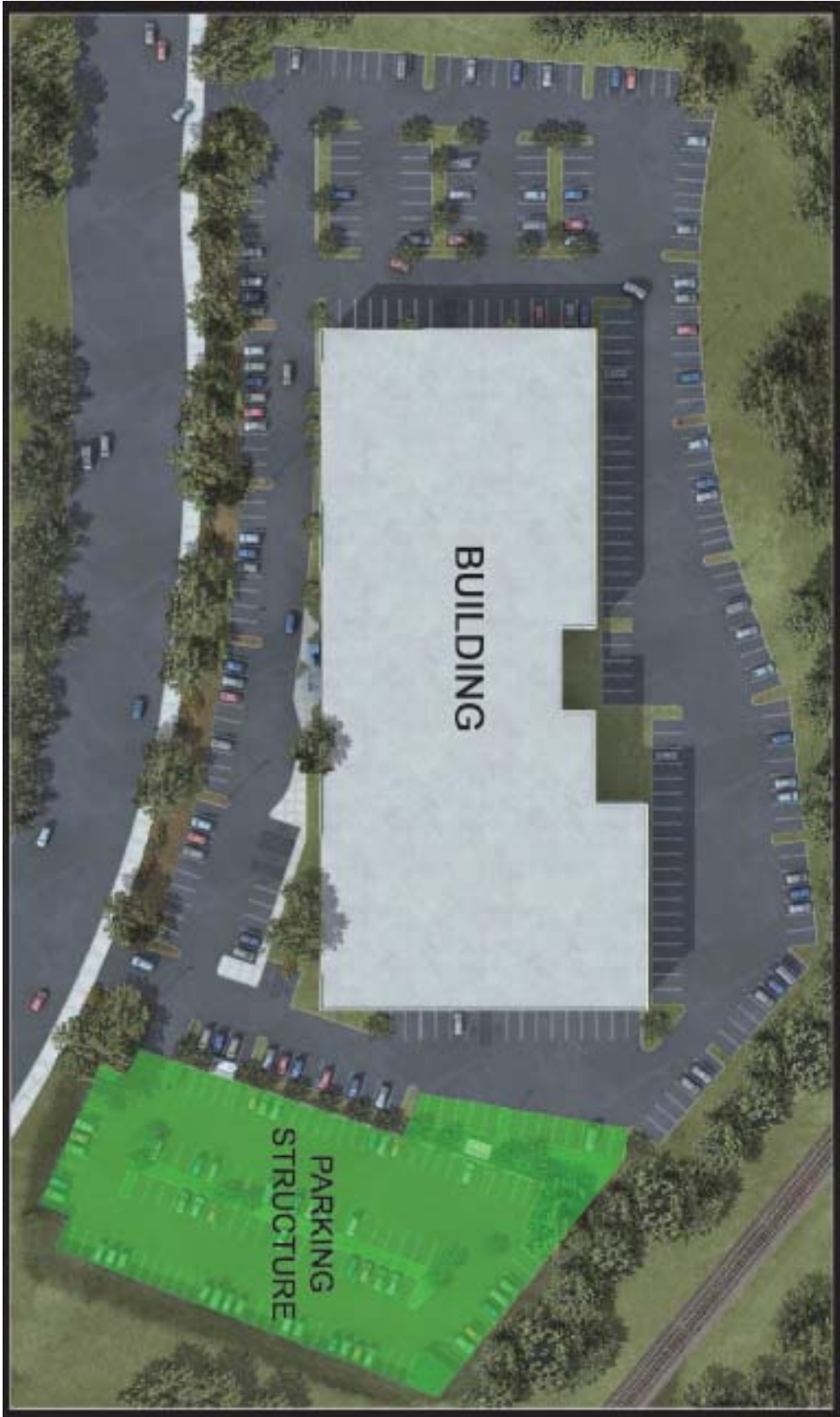
EXHIBIT A SITE AND PARKING PLAN