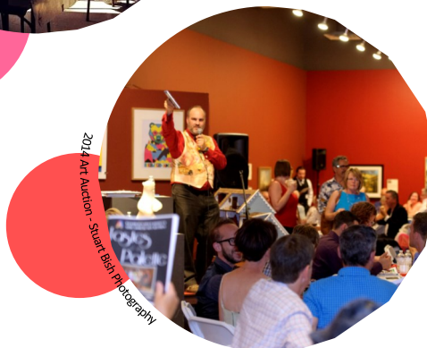
2014 Art Auction

MEMBERSHIP/ DONOR FORM PLEASE COMPLETE AND RETURN THIS FORM WITH YOUR PAYMENT.