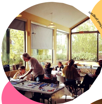
Young Adult Art Program