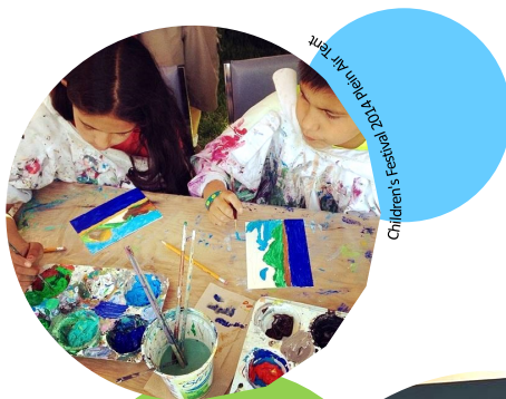
Children's Art Program