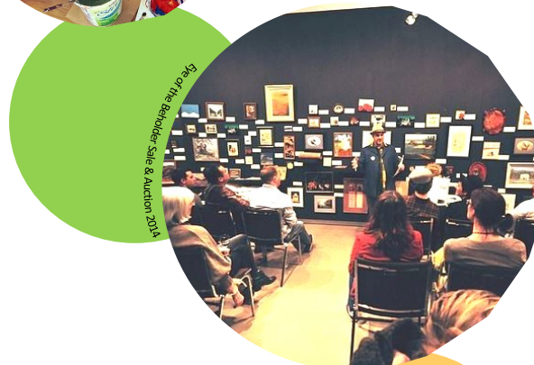
Top of the Bachelor Sale & Auction 2014