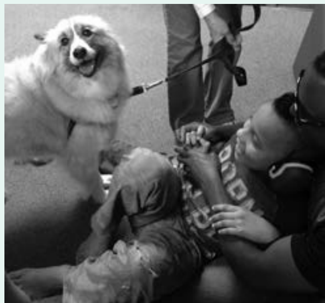
We all love Wisper. He makes us giggle and smile!