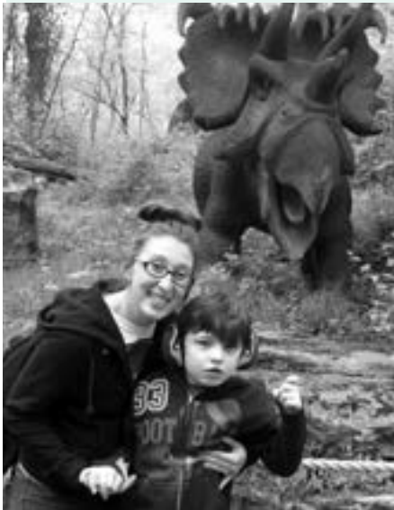
The Dino Days at Worlds of Fun was a great adventure.