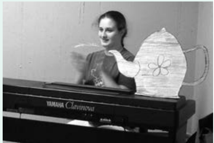
A piano and voice solo during our July drama presentation.