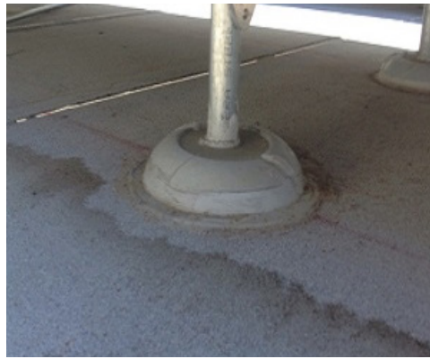
Cracking around the cold cement.