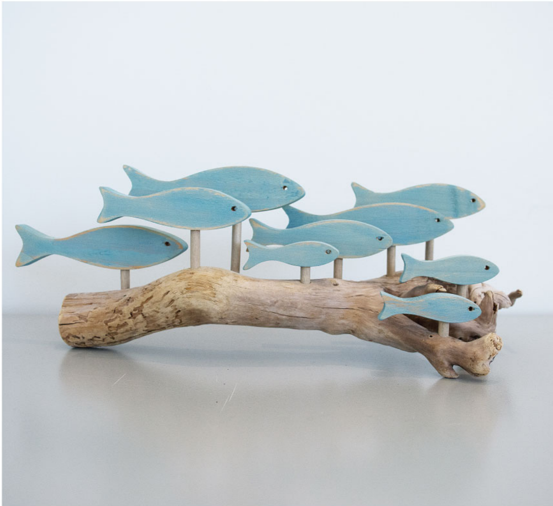
Jerry Walsh School of Fish , Unknown Wood and paint 13 cm x 33 cm