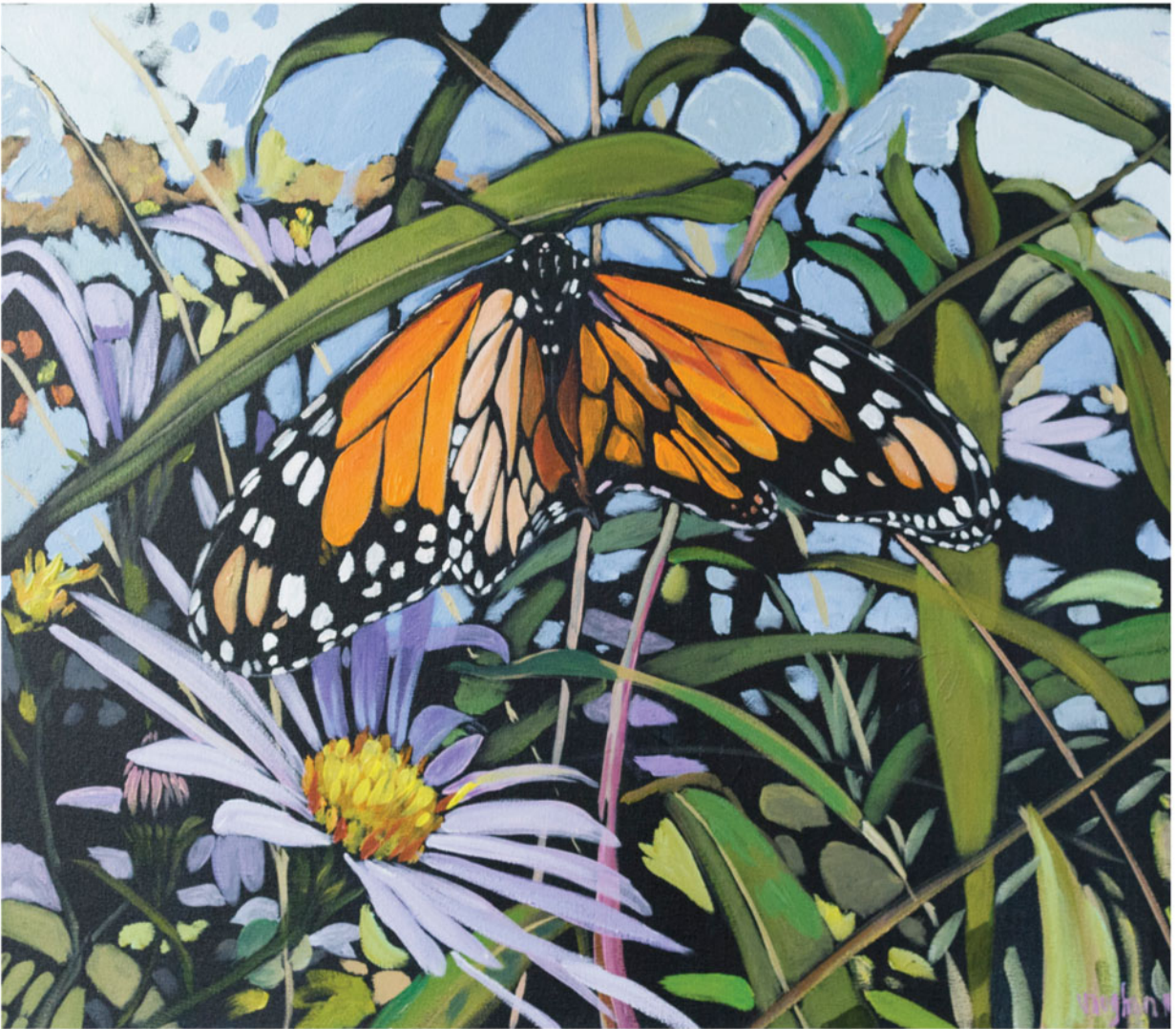
Jeremy Vaughan Summer Tangle , 2014 Acrylic on canvas 57 cm x 69 cm