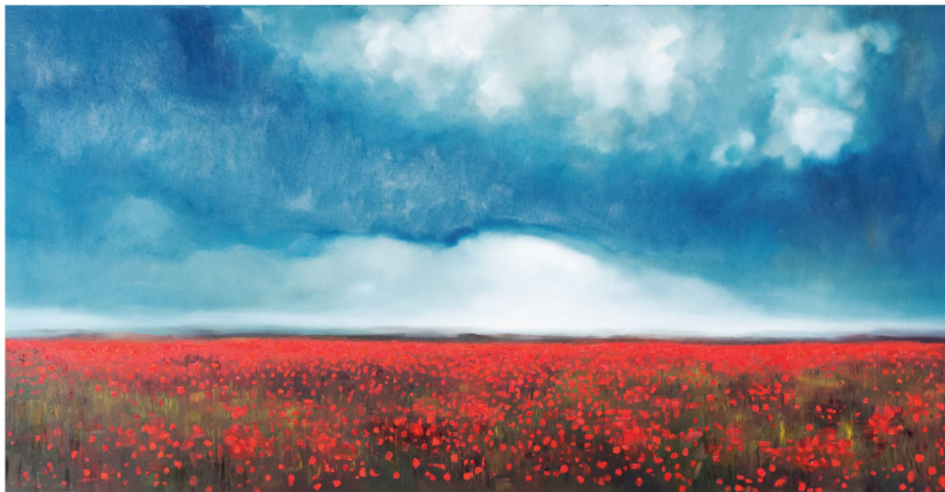
Ambera Wellman Storm Clearing , 2009 Oil on canvas 76 cm x 152 cm