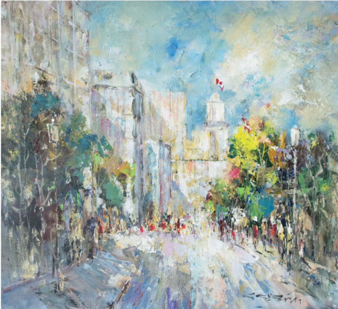
Gregory Gunter Burr Summer in the City of Halifax, 2014 Oil on canvas 76.2 cm x 91.44 cm