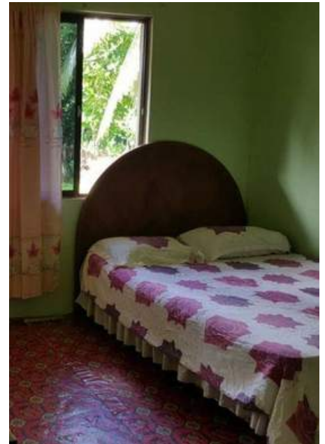
A picture from our village home stay accommodation in Namatakula

Meals will be provided along with refreshments throughout the duration of your stay. You will have access to shower and toilet facilities on site.