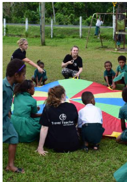
Travel and make an impact on youth education in the South Pacific

Please note that travel between Fiji and The Cook Islands is not included but we are able to advise you on your options and costs involved.