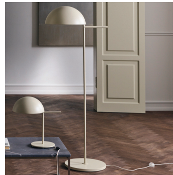
Aluna Floor Lamp