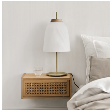
Campa Table Lamp

Ø27 cm, item no. 20-131-01 Ø35 cm, item no. 20-131-02 Ø50 cm, item no. 20-131-03