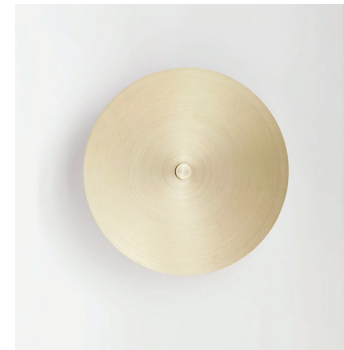
Reflection Wall Lamp