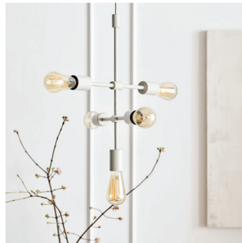
Piper Lounge Pendant 5-arms, item: 20-108-03