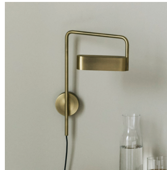
Scribe Wall Lamp