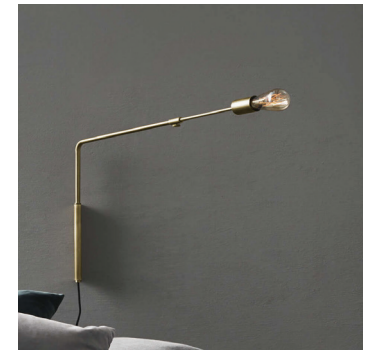
Piper Wall Lamp Item: 20-108-04