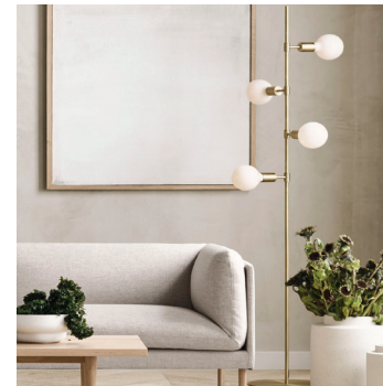
Piper Floor Lamp Item: 20-108-05