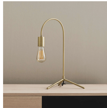
Piper Table Lamp Item: 20-108-01