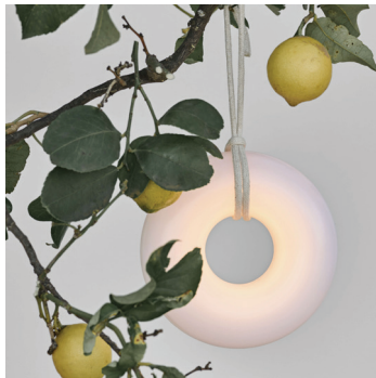
Donut Portable Lamp