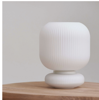
Maiko Table Lamp