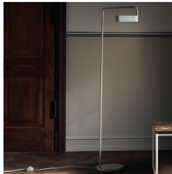
Scribe Floor Lamp