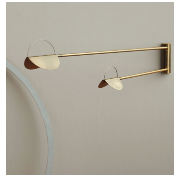
Leaves Wall Lamp