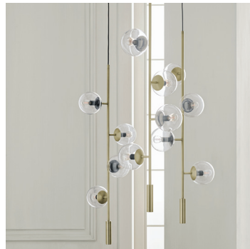
Orb Lounge Pendant

Item: 20-116-03 Ø15 cm, item: 20-116-05 Ø20 cm, item: 20-116-06 Ø25 cm, item: 20-116-07