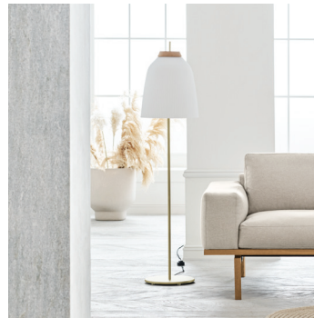
Campa Floor Lamp