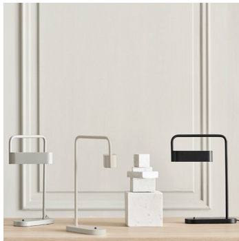
Scribe Table Lamp

DESIGNED BY Studio Finna MATERIAL Matt Antique Brass Plated Iron, Matt Black Painted Iron, Matt Grey Painted Iron or Matt Creme Painted Iron COUNTRY OF ORIGIN China