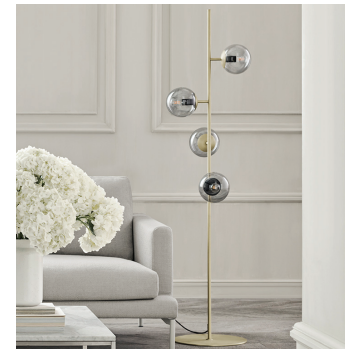
Orb Floor Lamp