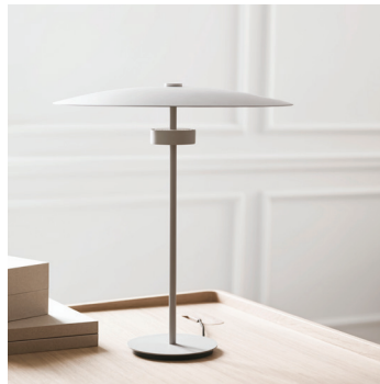
Reflection Table Lamp