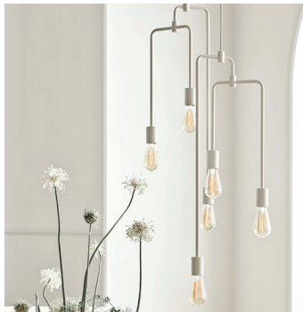
Piper Lounge Pendant 3-arms, item: 20-108-02

DESIGNED BY 365° North MATERIAL Matt Grey Painted iron, Black Painted Iron or Antique Brass Plated Iron COUNTRY OF ORIGIN China