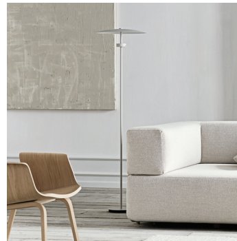
Reflection Floor Lamp