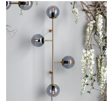
Orb Wall Lamp