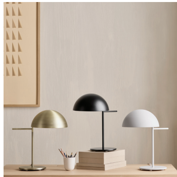
Aluna Table Lamp

Ø27 cm, item: 20-130-04 Ø38 cm, item: 20-130-05 Ø60 cm, item: 20-130-06