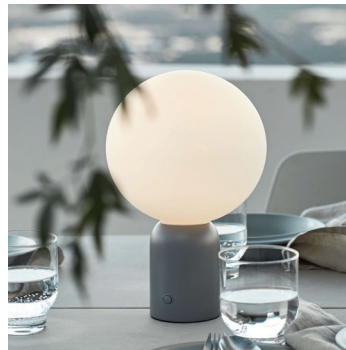
Pica Portable Table Lamp