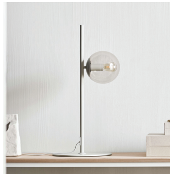
Orb Table Lamp