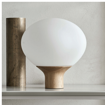
Acorn Table Lamps

Ø21 cm, item: 20-133-01 Ø32 cm, item: 20-133-02 Ø41 cm, item: 20-133-03 Ø64 cm, item: 20-133-07