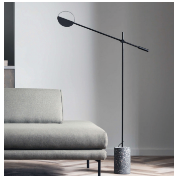
Leaves Floor Lamp