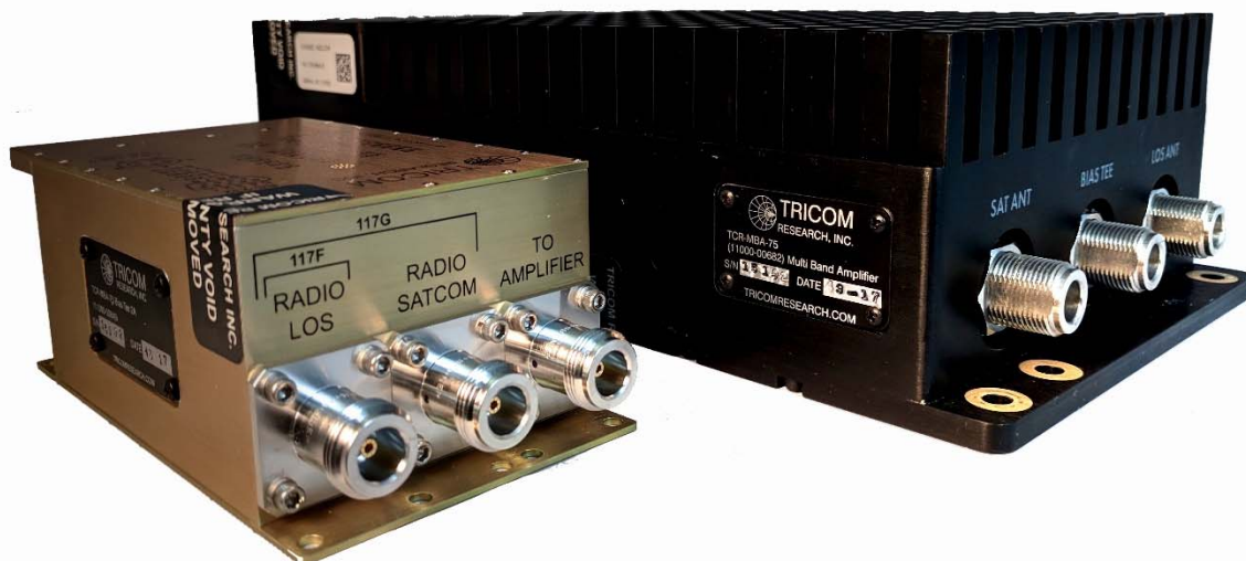
Figure 1-1. TCR-MBA-75 System Components (pictured with BIAS TEE 2A)

The TCR-MBA-75 is DAMA Certified with several UHF SATCOM terminals. For a listing of the current certifications please see the Joint Interoperability Test Command (JITC) website.