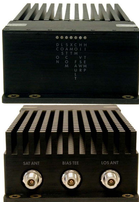
Figure 2-1. TCR-MBA-75 Controls, Indicators, and Connectors

There are also several status indicators on the Amplifier's front panel as shown in Figures 2-1 and 2-2. The functions of these are specified in Tables 2-1 and 2-2.