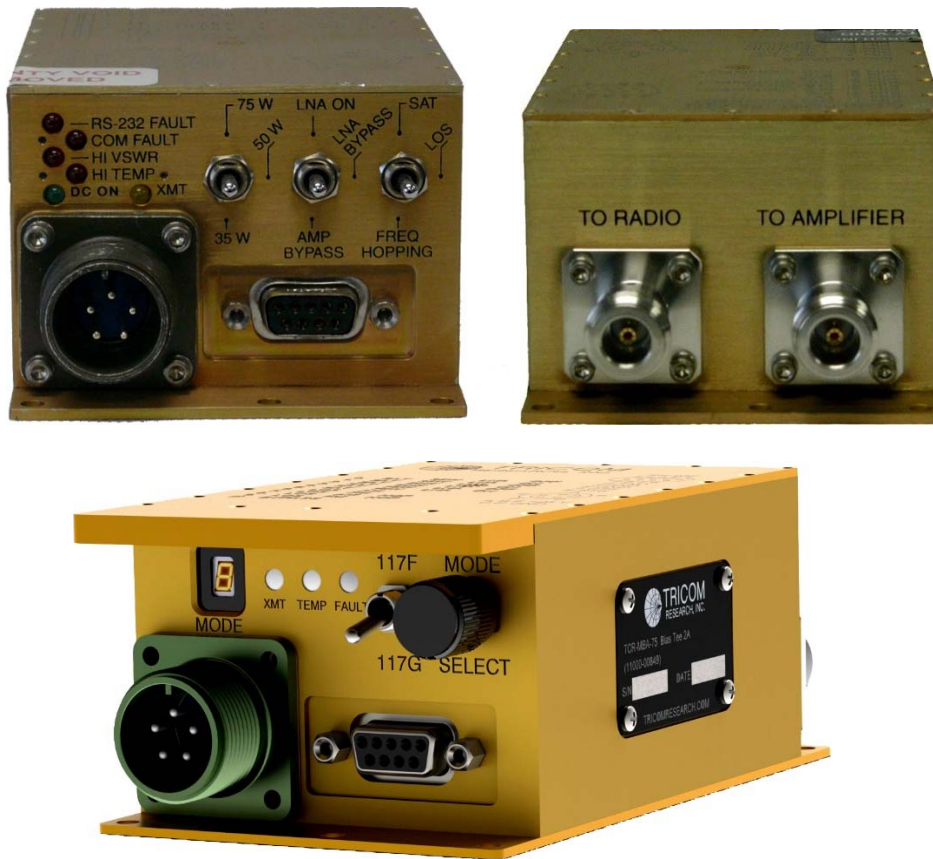
Figure 2-2. BIAS TEE II (and 2A) Controls, Indicators, and Connectors