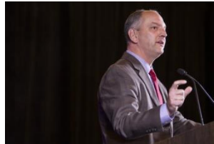
Louisiana, Cuba commit to trading more -- if embargo is lifted The governor is visiting Cuba all week.