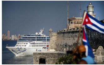
Why a New Orleans-Cuba cruise could soon become reality (again) A measure allowing Americans to travel freely to Cuba has won U.S. Senate approval.

President-elect Donald Trump threatened during the campaign to revert to more restrictions on travel and trade with Cuba. He said he would undo Obama's warming of the U.S.-Cuba relationship.