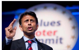
Bobby Jindal spends $73,000 in taxpayer funds on state police protection in Europe

"We believe Louisiana is the only U.S. state to succeed in arranging meetings with all of the top Cuban government ministries for which we requested an audience," Pierson said.