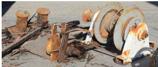
Avalon hardware 3/5/2105