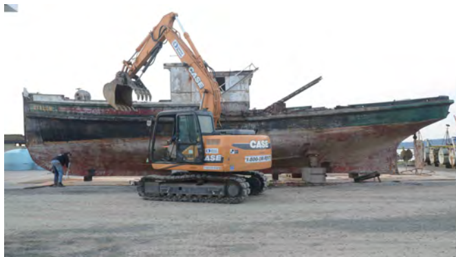
Avalon staged for deconstruction 3/4/2015