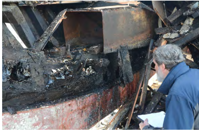
Jack Becker retrieving Avalon construction details 3/5/2015