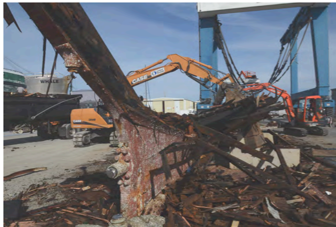
Avalon – backbone, late afternoon 3/5/2015 Port Townsend, WA