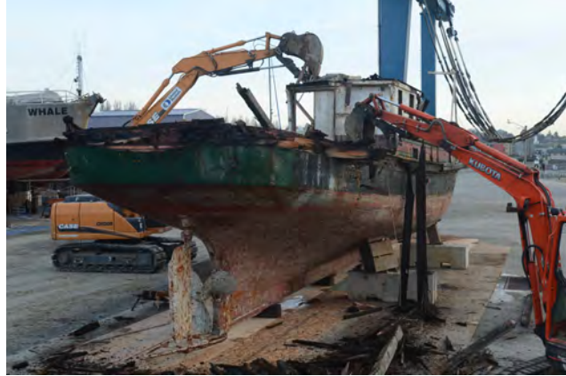
Avalon on large-washdown pad, Port Townsend, WA. 3/5/2015