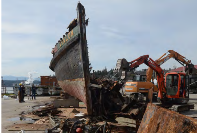
Avalon - afternoon 3/5/2015 Port Townsend, WA