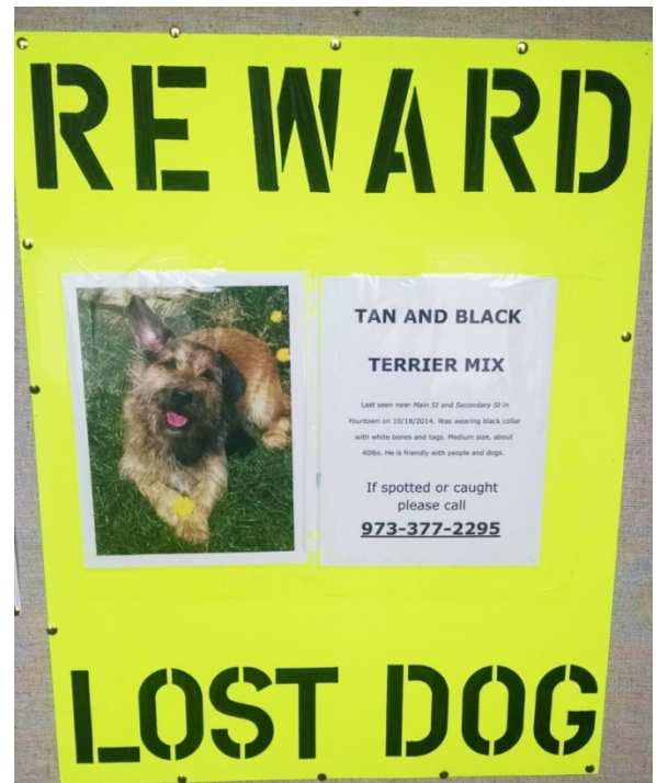
4" stencils used on 22" x 28" poster