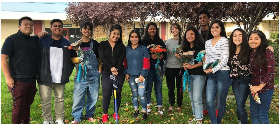
Our Class of 2018 seniors celebrated submitting their college applications by breaking a piñata – a beloved Breakthrough Silicon Valley tradition.