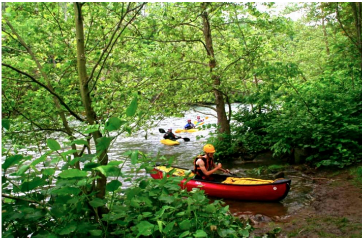
A reclaimed stream in Maryland, now home to a bustling recreational tourism industry.

The RECLAIM Act would create thousands of jobs across the country reclaiming old coal mines, and would spur economic opportunities in agriculture, energy, recreational tourism, and beyond on reclaimed mines.