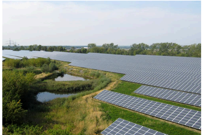
A reclaimed coal processing plant in Germany, now a large solar array.

The RECLAIM Act would distribute $1 billion from the existing federal Abandoned Mine Land (AML) Fund to states and tribes across the country.