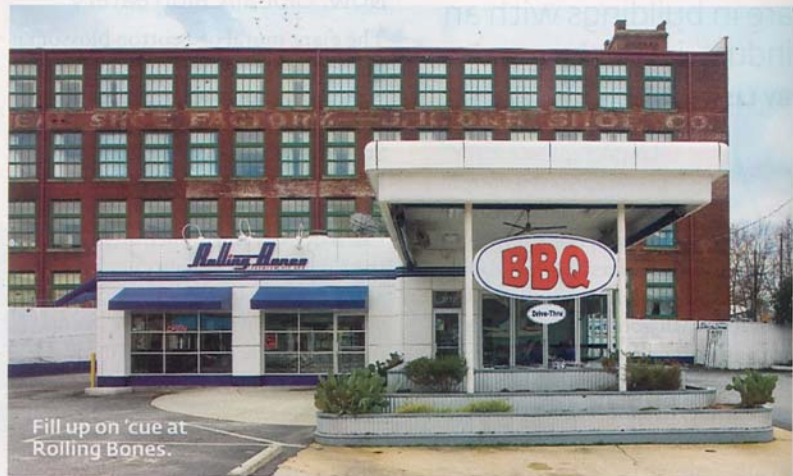
Fill up on 'cue at Rolling Bones.

Recycling a gas station worked for Watershed in Decatur, so there's no reason others can't pump up the energy. Rolling Bones Premium Pit BBQ serves traditional barbecue in a retro diner atmosphere. New chef and part owner Todd Richards (formerly at Four Seasons Hotel) has already put the eatery on a national list of best BBQ restaurants. Offerings include a pulled duck sandwich with fig relish and a half-slab of smoked pork ribs. 377 Edgewood Avenue; rollingbonesbbq.com