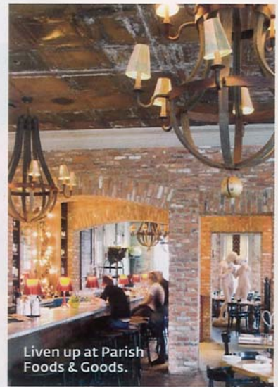
Liven up at Parish Foods & Goods.