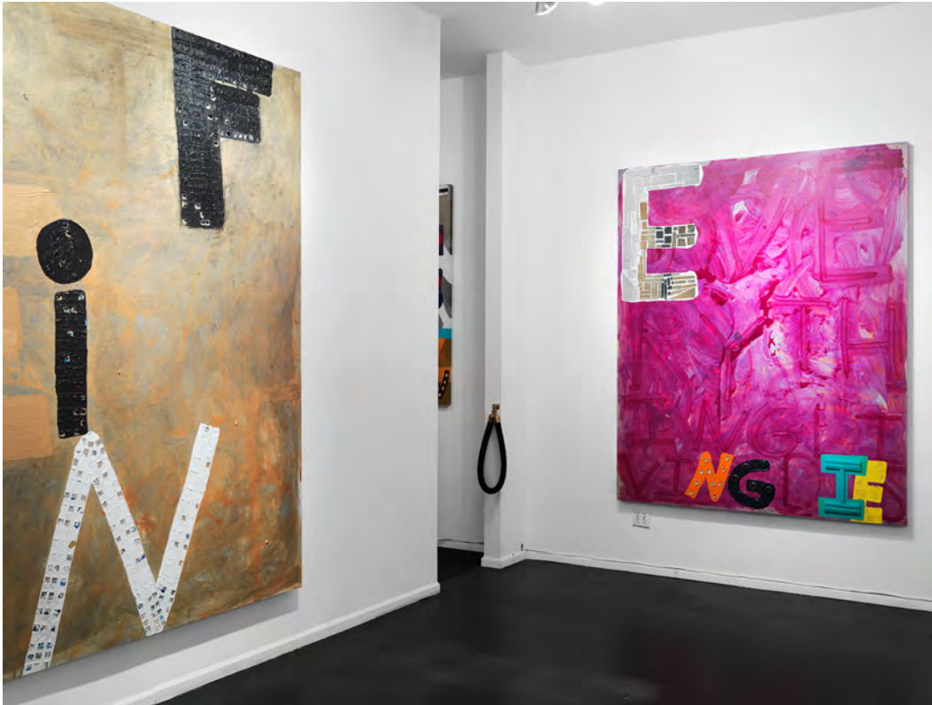
Installation view. Left to right: "Fine as Wine" (2016) and "Life" (2015).