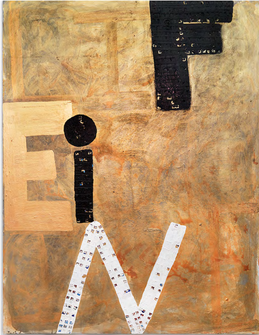
Samuel Jablon, "Fine as Wine" (2016), acrylic and glass tile on wood panel (96x72 inches)

language is the sole content in these works, color and texture hold equal content. I wanted the works to be about painting as much as they are about language. I'm interested in materiality and the tension between what can be seen and what is legible.