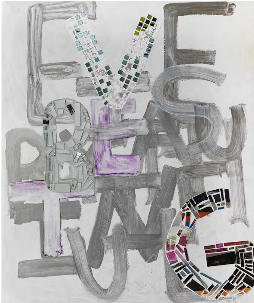
Samuel Jablon, "Beautiful Everything" (2016), acrylic, mirror and glass tile on wood panel (72x60 inches)

advertisements, and the language or phrases that cycle around those ideas. I'm curious how poetry changes as it is brought into different environments. I find it exciting to jump from a performance, to a painting and then back to a poem.