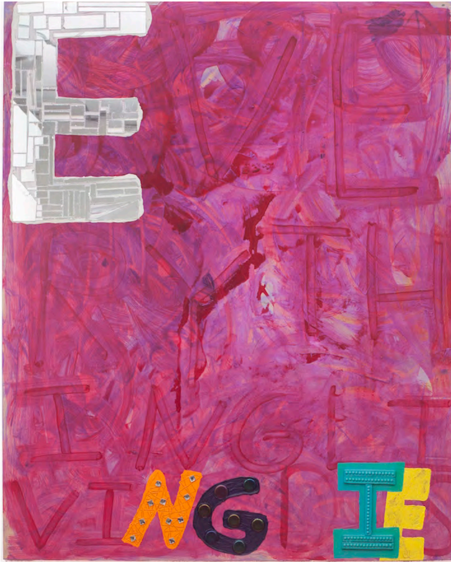
Samuel Jablon, "Life" (2015), acrylic, mirror and glass tile on wood panel (84x68 inches)

RG: A few new paintings you showed me have one word rather than groups. One of your new "Ugly"s for example, looked purple, almost like a sign or symbol. I always think of the quotes having a closed circuit quality, like they don't care about me cause they'll keep doing what they are doing, but simple ones keep pointing elsewhere. A little endless, is this a newer development? Maybe I'm just reading into this.