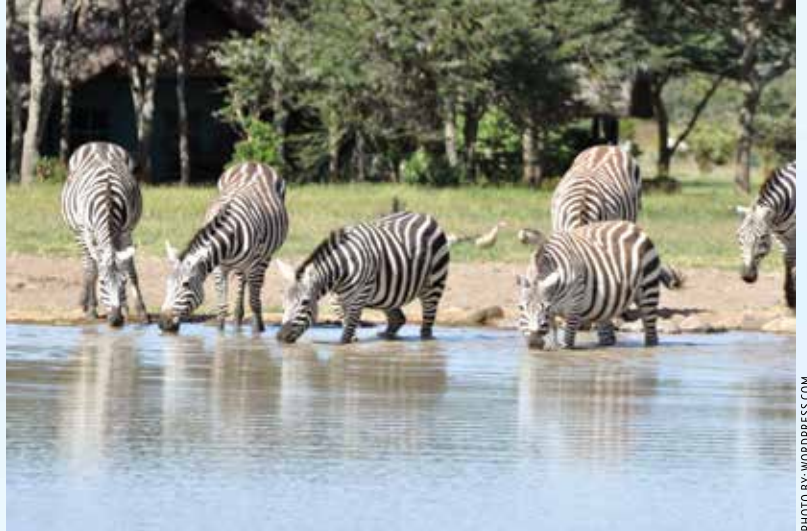
TOP: Zebras quenching their thirst in a lake in Ol Pejeta.

Conservancies are mostly located in remote areas often under-served by government services. Perceptions of neglect and lack of livelihood alternatives create insecurity for both people and wildlife. Recent sad events in Laikipia, Baringo, Samburu, Isiolo and Marsabit, West Pokot and Turkana Counties illustrate how this reality can so quickly become violent. In these regions, conservancies show that they can act as critical community institutions positioned as intermediaries between local communities, their environments, and the government. As a democratic institutions, conservancies offer an entry point to communities for county and national governments, development partners,