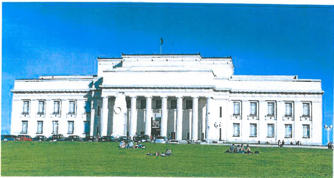
Exhibition central: The Auckland War Memorial Museum.