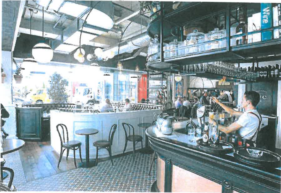
Menu magic: Baduzzi, where meatballs take centre stage.