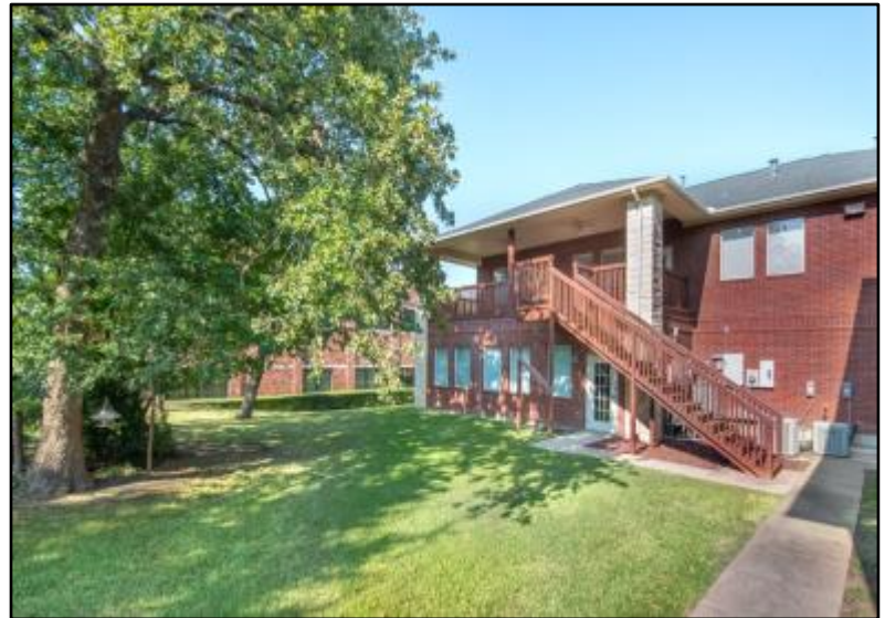
Back of Building with Balcony