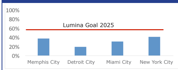
Figure 2: Percentage of Adults with Associate, Bachelor or Professional Degree (2013)