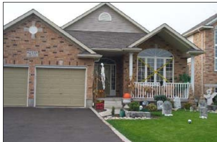
1st Place - 458 Cabot Trail