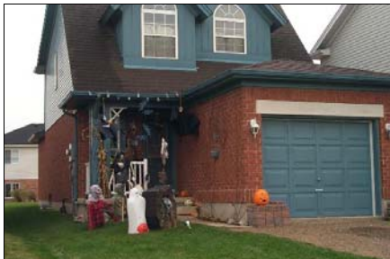
2nd Place - 475 Citadel Court.