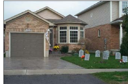
3rd Place - 593 Windjammer Way