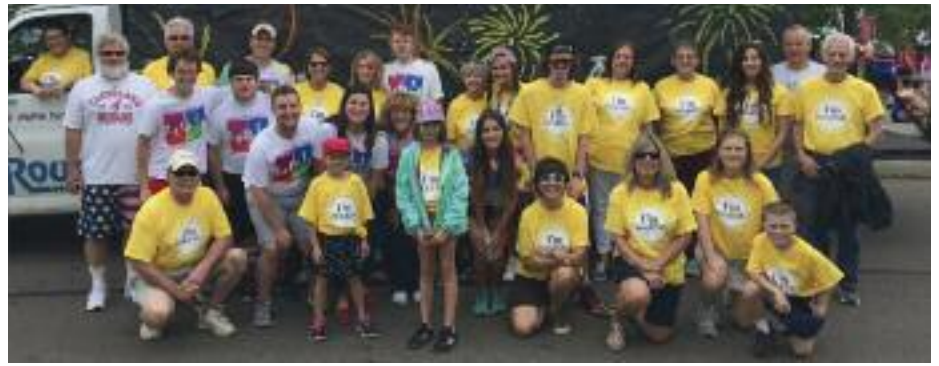
July 4th parade 2016

I wish I had room to tell you the many stories of how WARM has affected the lives of our clients with the help they have received. They are stories of life transformation. Simply put...WARM changes lives! Through compassionate services and relevant programs, the well-being of the people we serve improves dramatically.