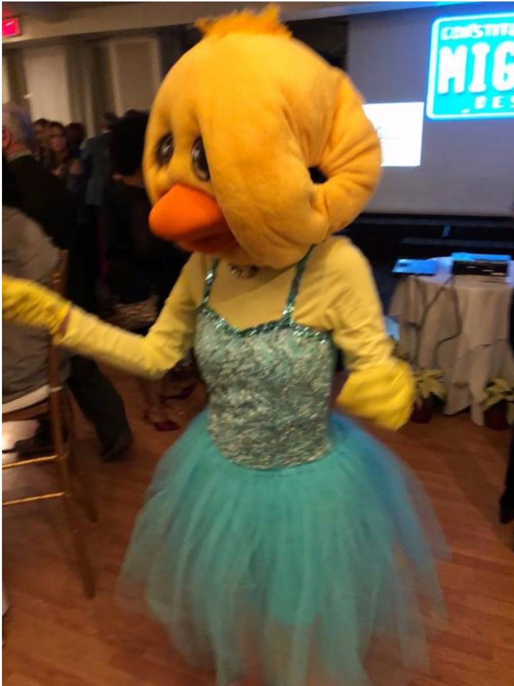
after party party