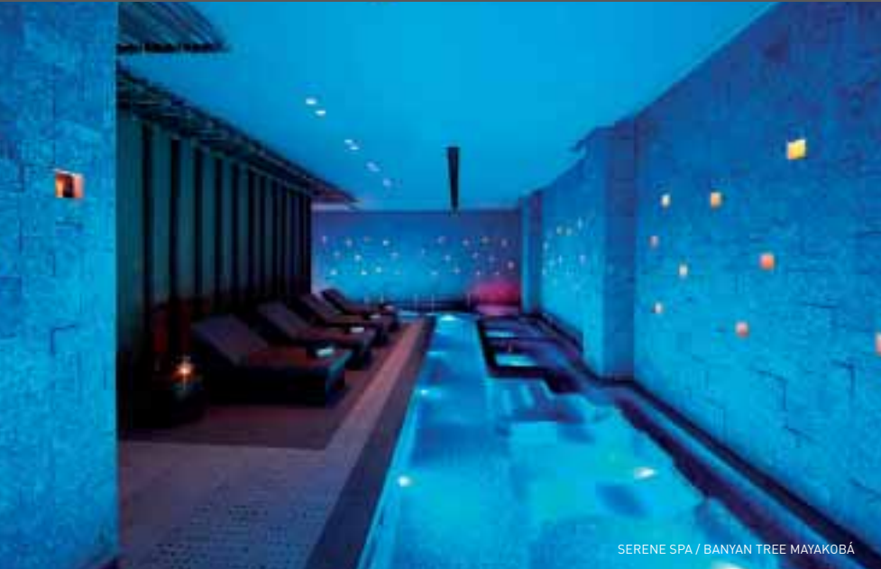
SERENE SPA / BANYAN TREE MAYAKOBÁ