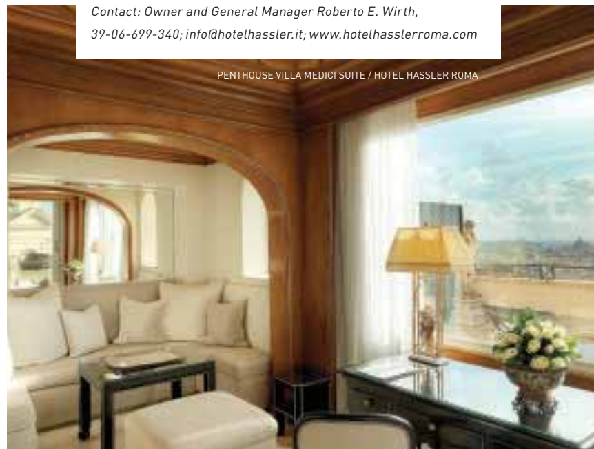
PENTHOUSE VILLA MEDICI SUITE / HOTEL HASSLER ROMA