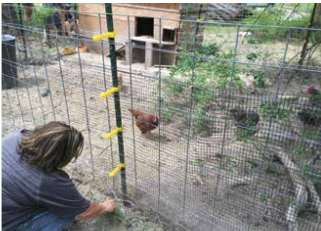
Completed electric bear fences containing bear attractants

If you are interested in learning more about any of SVC's conservation programs, please contact us for assistance!