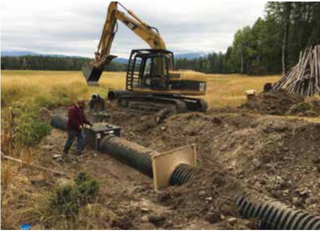
Matthews Brothers Construction installing water control structure at outlet of ditched and drained wetland

SVC continues to partner with the U.S. Fish and Wildlife Services Partners for Fish and Wildlife Program to restore degraded or manipulated wetlands and streams on private lands in the Swan Valley. In 2017, SVC worked to restore a 48 acre wetland in the Kraft Creek area, one of the largest ditched and drained wetlands in the Swan. SVC has now partnered with private landowners to restore over 140 acres of wetland, stream, and riparian habitat in the Swan Valley. SVC works to restore degraded wetlands for the benefit of wetland and riparian dependent wildlife, such as grizzly bears and trumpeter swans. Wetland restoration can also lead to improved water quality and quantity, which can benefit both native fish (bull trout and westslope cutthroat trout) and people!