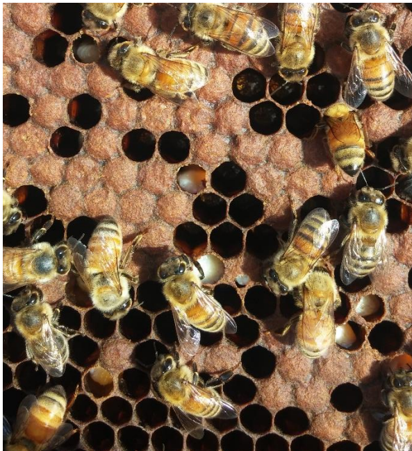
Colony with parasitic mite syndrome. This colony has a high population of mites. Note the sick, melted looking larvae. There is a very low chance that this colony could survive the stress of winter, even if varroa was controlled at this point.

Even with exponential growth it takes some time for varroa populations to get to dangerous levels. In the real world, they often grow all summer and peak right when winter bees are being raised (late summer / early fall). These winter bees have to survive a period of high stress, and can't handle the extra challenge of being bitten and filled with viruses. This is one of the reasons that varroa mites kill colonies so often in the fall/ early winter.