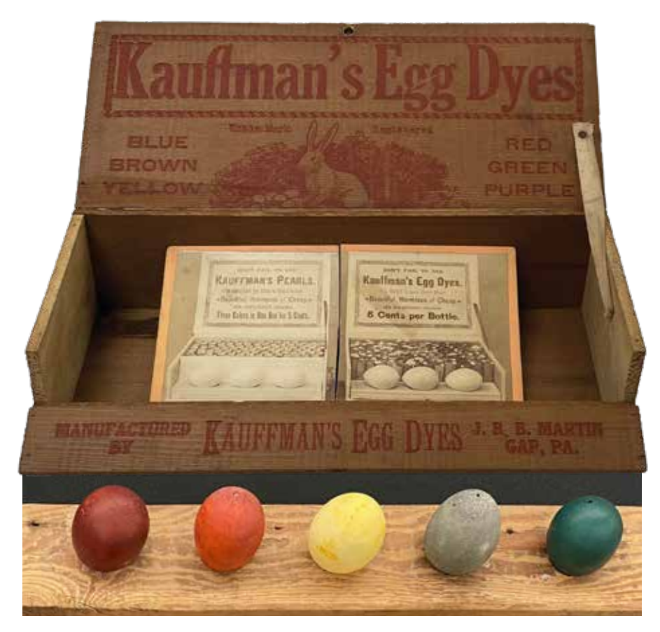
Top: Kauffman's Egg Dyes, J.R.B. Martin, Gap, Lancaster County, ca. 1890, Pennsylvania German Cultural Heritage Center, Kutztown University. While some families favored traditional homemade dyes from onion skins and other natural botanicals, commercial dyes gained popularity in the late nineteenth century. These chemical dyes were sold in packets at general stores and pharmacies. Although Kauffman's dyes were advertised as harmless and safe, many families avoided chemical dyes due to the perception that dyes not made from botanicals were poisonous. Bottom: Natural Easter egg dyes, Pennsylvania German Cultural Heritage Center, Kutztown University. A range of colored eggs dyed (left to right) with onion skins, turmeric and onion skins, turmeric, blue berries, and hibiscus.

onion skins in a pot of water with a tablespoon of vinegar added to bind the color to the eggs. Coldwater dyeing is also popular, which allows eggs to be hollowed out or hard boiled separately. Dyes can be prepared by boiling the dye plants, followed by cooling and storing the dyes in jars in a refrigerator for later use. Hollow eggs typically require gentle weights to fully submerge them in cold water dyes.