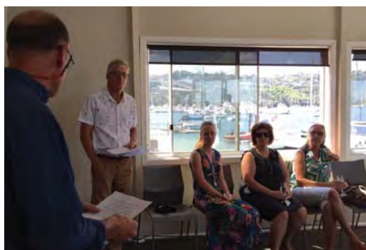
Middle Harbour Yacht Club