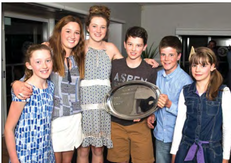
2015 NSW Alpine Ski Club Award