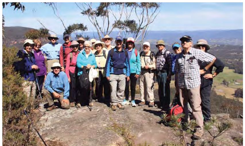
Overlooking Megalong Valley