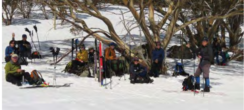
Lunch in the Snowgums

It was a fabulous week made possible by the help and support of our Managers and staff.