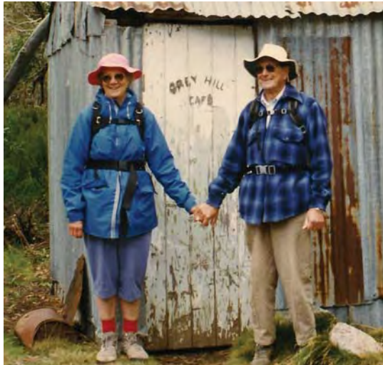
Nordic week 2007 - aged 88 and still skiing well

Charlie encouraged many members to give cross country skiing a go, and for some the Summit Tour XC bus trip was their introduction to XC skiing and the club.