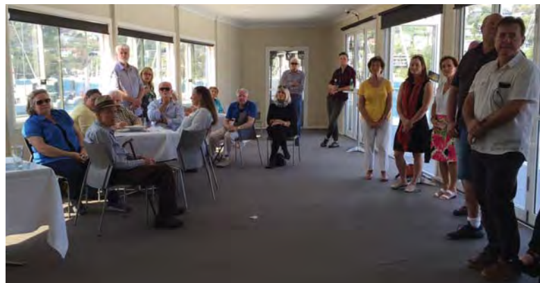
Middle Harbour Yacht Club