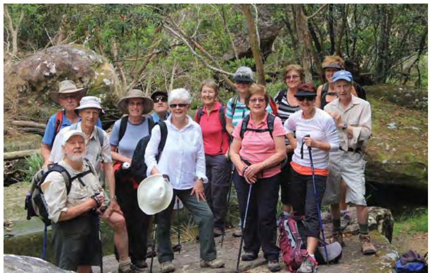
Morning Tea by Cockle Creek

For our annual Blue Mountains walk, 19 members met at the recently renovated Hydro Majestic Hotel. Highlights of the walk were the Three Brothers (smaller version of the "Three Sisters"), morning tea overlooking the Megalong Valley, the old flying fox that used to service the Hydro, the old "Sun Bath". The walk ended with a well-earned coffee at the Hydro Majestic.