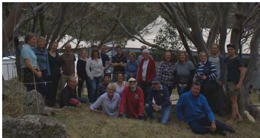
Southern Alps Lodge Stores Weekend