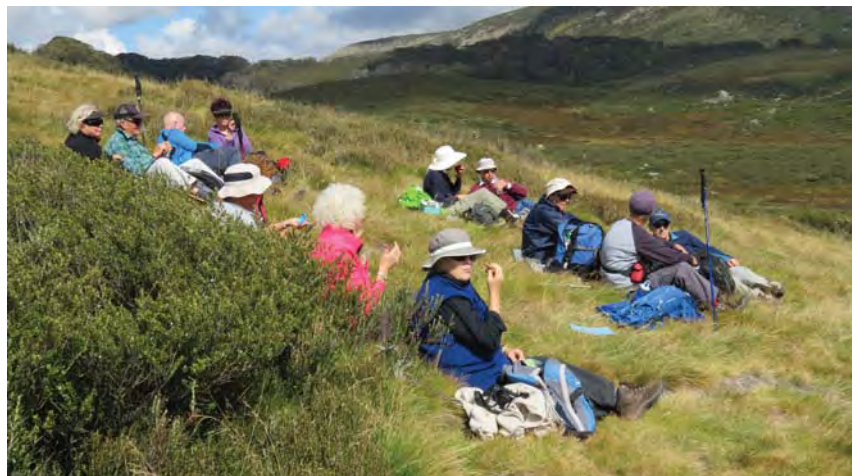
Lunch at Illawong

Finally, just a reminder, everyone is welcome on our walks, we look forward to seeing you on a trip soon.