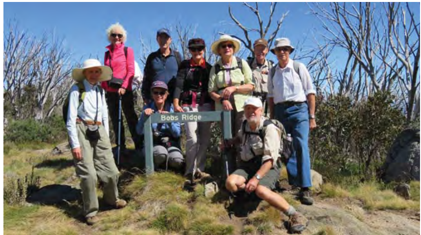
Bobs Ridge Lookout

Another great Easter in the mountains - we had 33 walkers join us for the event. Walks included Bobs' Ridge (from Dead Horse gap), Illawong, The Lakes Circuit and Porcupine Rocks. We visited the Lakelight Sculptures at Jindabyne and generally enjoyed the peace and quiet of the mountains. Many thanks to all who provided a group meal, it was a tremendous success and another thankyou to those who prepared slide presentations of their recent overseas trips/walks.