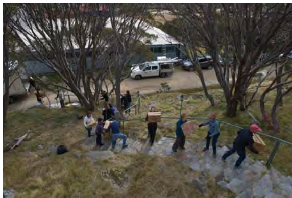
Southern Alps Lodge Stores Weekend