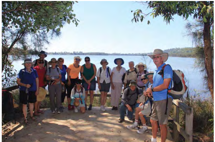
Narrabeen Lakes Circuit

The completed circuit was officially opened just days before our planned walk, so it was very popular with the locals. It's a great walk (or cycle) with plenty of views and places to stop. We had 17 members join us for this walk. After the walk we stopped off at North Curl Curl for a swim then back to Rosemary & Gordons home for some après-walking.