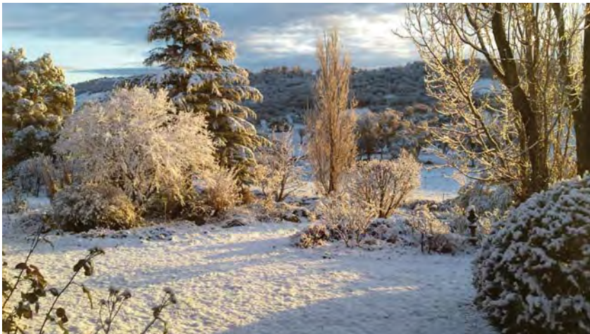
Jindabyne before 2015 season opening

We have already had a great dump of snow so the resorts are certainly off to a great start to the season....let us hope we do.