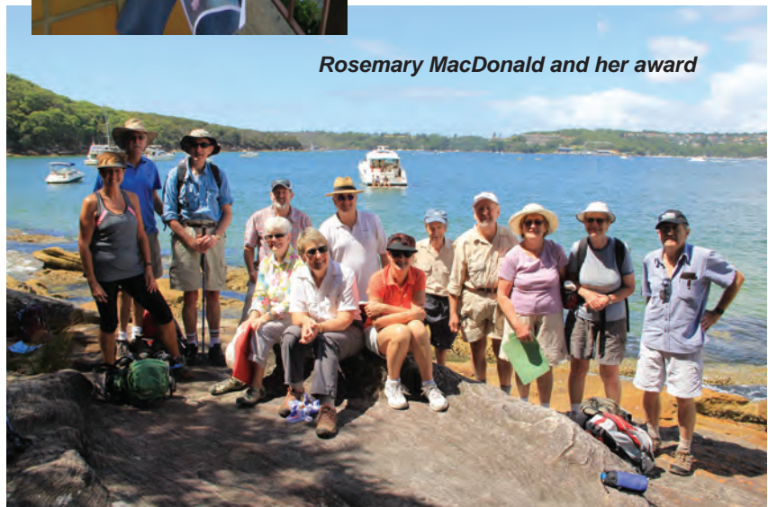
Morning Tea on Sydney Harbour