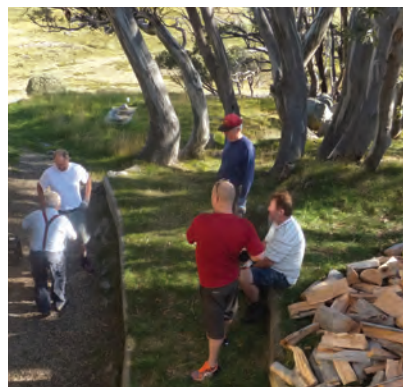
Moving the woodpile at Kahane