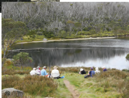
Lunch at Rainbow Lake