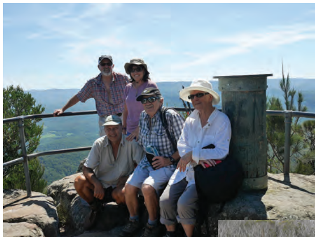
On Pigeon House Mtn

Some event organisers are making Snowracer registration compulsory - for details go to www.snowracer.com.au