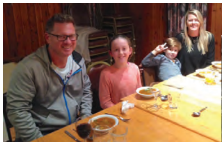
Stores Weekend - Charlotte Pass