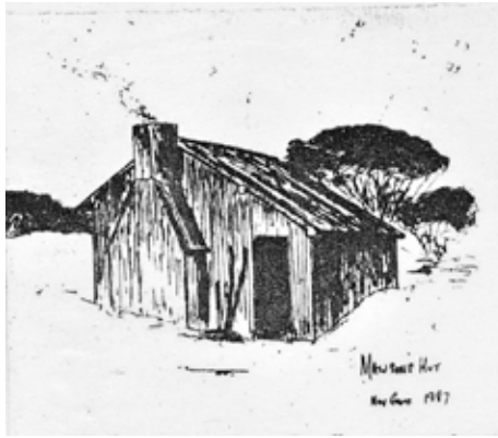
Drawing of Mawson Hut by Neville Gare

There is nothing quite the same as the clatter of boots on bare boards early on a cold autumn