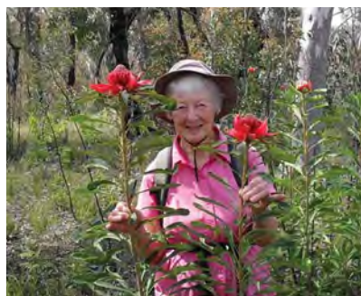
Waratahs on Ikara Head walk