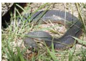
Highland copperhead enjoying some warm sun at Charlotte Pass

also email to sasccoop@bigpond.com or post to Beverly Endicott 30 Pope Avenue, Berrara 2540