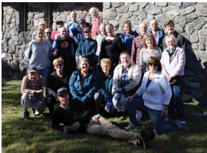
Charlotte Pass Lodge Stores Weekend