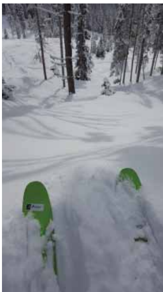
2016 Raffle Winner, Mick, finding some yummy powder in the trees - superb!

The NSW National Parks and Wildlife Service (NPWS) has installed number plate recognition cameras at entrances to Kosciuszko National Park (KNP) to allow future automated tolling. NPWS have confirmed that there will be no change to how fees will be collected for the 2017 winter season.