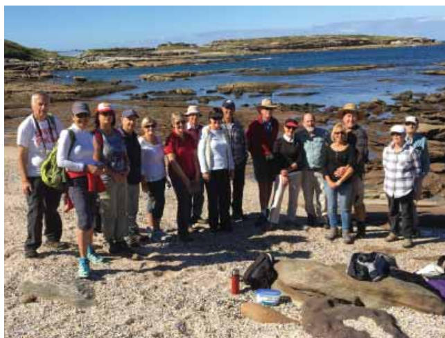
Morning tea near Cape Banks