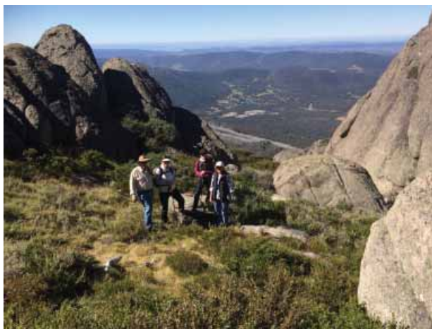
Porcupine Walk Easter 2017

Just a reminder that we keep a club EPIRB at our Charlotte Pass Lodge. If you are staying at the lodge and planning an extended day trip or an overnight ski-tour/walk, then please consider borrowing the EPIRB. We only ask that you complete a trip register detailing your planned activity.