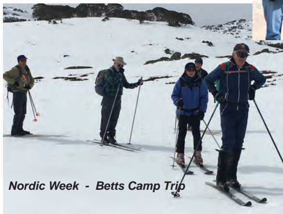
Nordic Week - Betts Camp Trip

Unfortunately we had to cancel this walk due to the heavy rain, our only cancellation for the year.