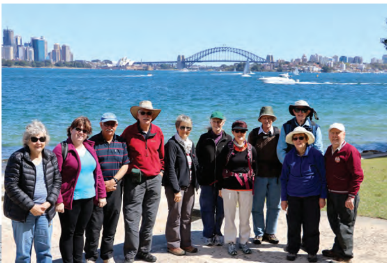
Morning Tea at Bradleys Head

We look forward to seeing you on a walk soon.