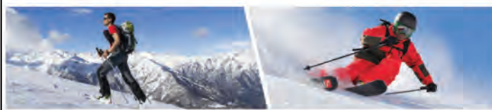
Sun Peaks 2018-19 Season opening day

TO JOIN, GO TO www.alpsport.com.au/alpsport-vip-club