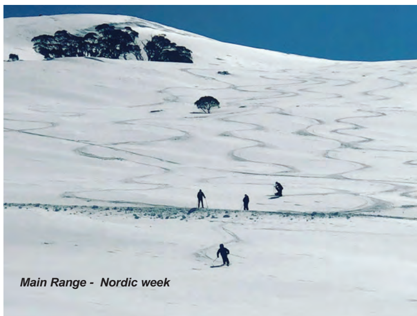
Main Range - Nordic week