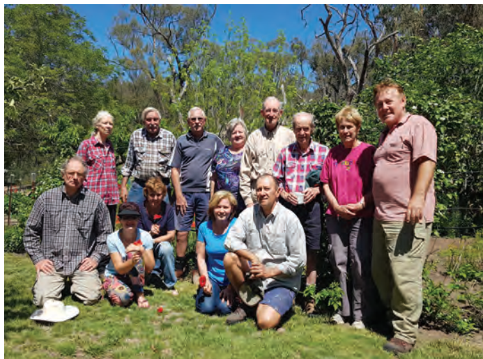
Remembrance Poppies - Abercrombie River NP

November – 4WD/Camping Week-end at Abercrombie River NP