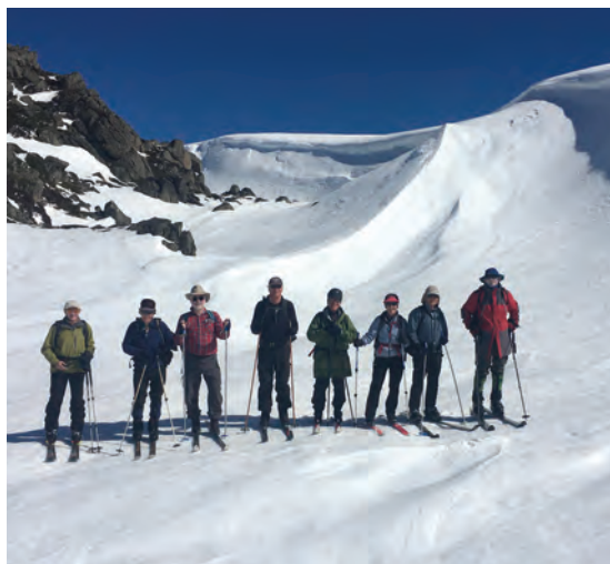
Nordic week – Snowy River Gorge below Seaman's Hut