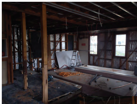
Down to the bones at Charlotte Pass